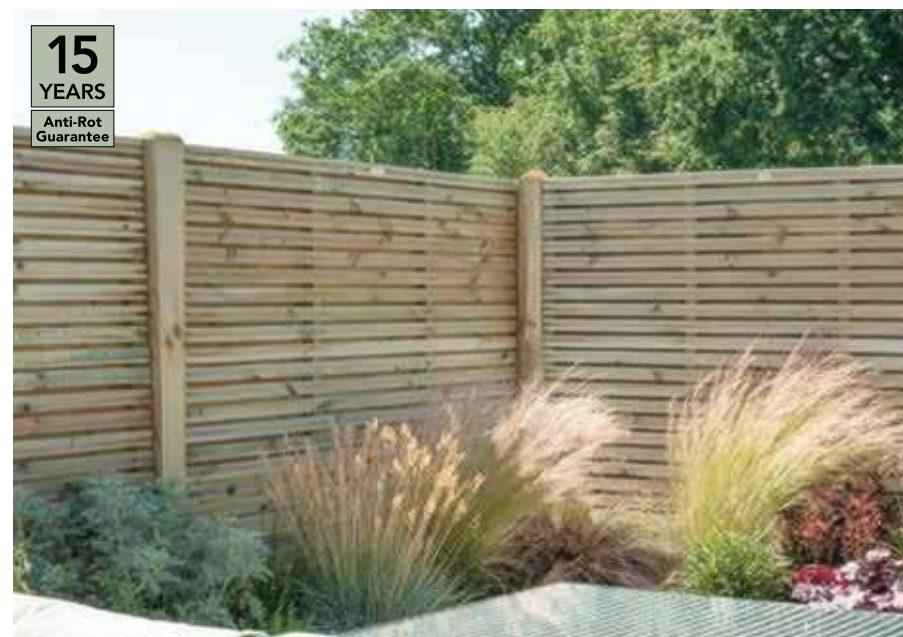
Contemporary Double Slatted Panel