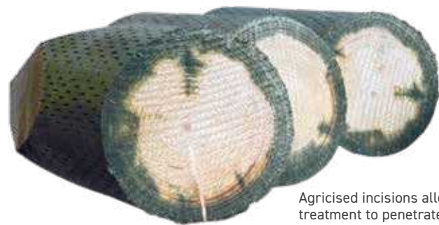
Agricised incisions allow treatment to penetrate deep into the post

Lasts 3 x longer, comes with no quibble warranty and saves money over 15 years