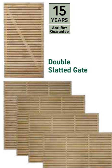
Double Slatted Gate