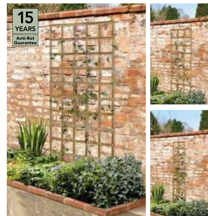
Smooth Planed Trellis