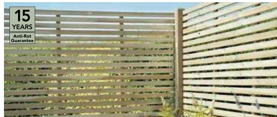
Contemporary Single Slatted Panel

The timber is pressure treated to give a 15-year anti-rot guarantee and the panel can also be used without gravel boards. Available in 4 heights - 6ft (1.80m), 5ft (1.50m), 4ft (1.20m) and 3ft (0.9m).