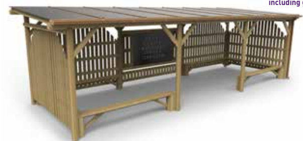
Polycarbonate roof including guttering

The timber roof has two add on options that can be selected, chose from either a Polycarbonate roof or a Fabric roof to create shelter from the elements.