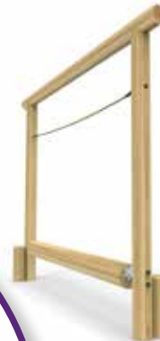
Rock & Roll Log