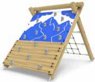
Large A Frame - Net & Rock Wall Climber