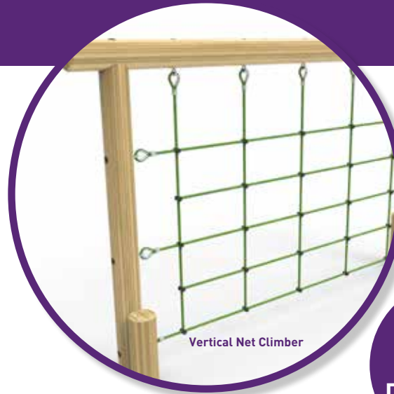
Vertical Net Climber