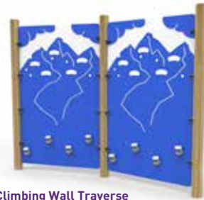
Solid Climbing Wall Traverse