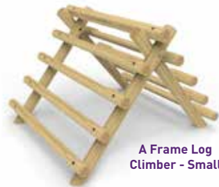
A Frame Log Climber - Small