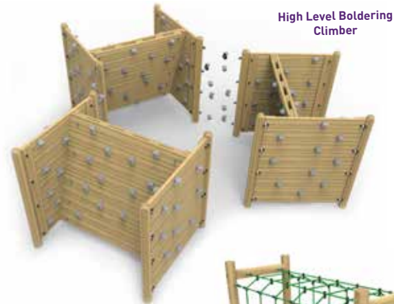
High Level Boldering Climber

The range features over 50 timber trail products allowing you to design exciting play areas to meet customer requirements.