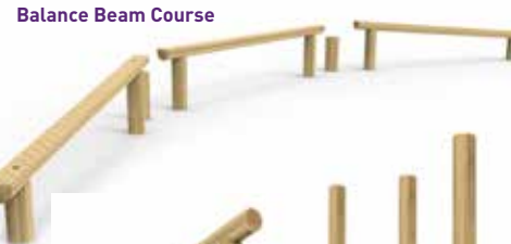
Balance Beam Course