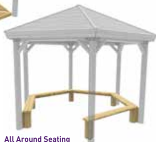
All Around Seating