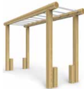
Monkey Walk Station