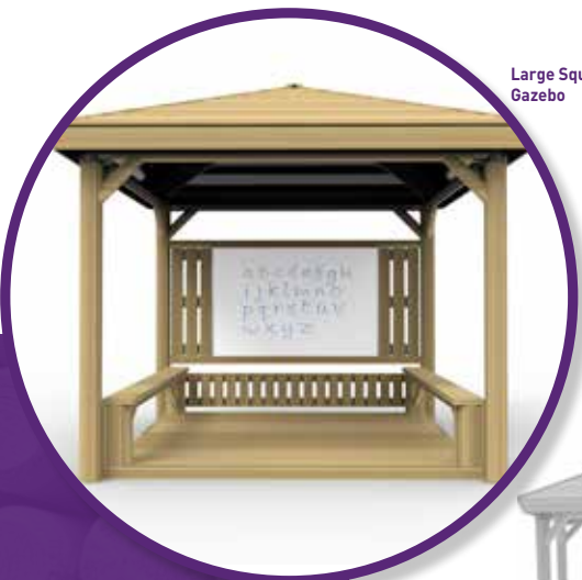
Large Square Gazebo

The square, hexagonal and extended hexagonal Gazebo range is available in a choice of six different sizes, with a timber roof featuring a unique waterproof lining providing the perfect cover from the elements.