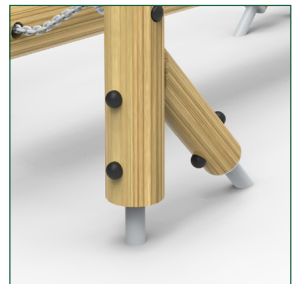
* Steel Foot Option "-SF"