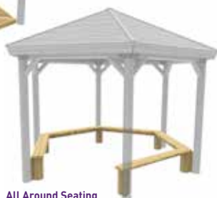
All Around Seating