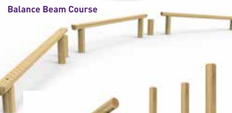
Balance Beam Course