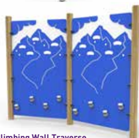
Solid Climbing Wall Traverse