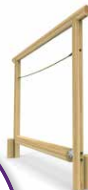
Rock & Roll Log