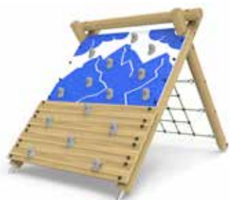
Large A Frame - Net & Rock Wall Climber