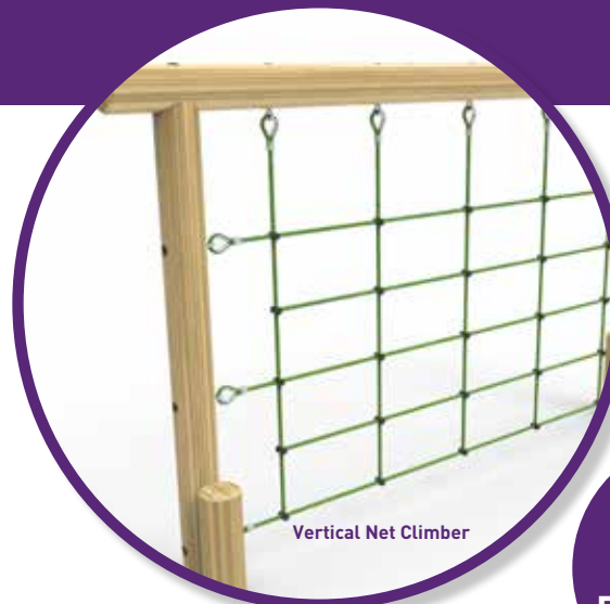
Vertical Net Climber