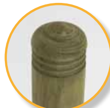
Low Dome High Triple Rout