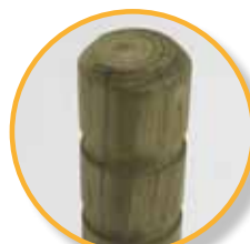
Chamfered, Deep Rout Duo

The M&M Timber range of bollards are a premium choice for creating secure, tactile and durable boundary markers.