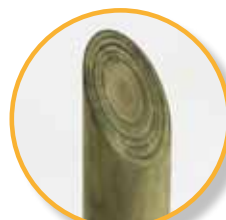
Dragons Tooth Top