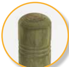
Low Dome Triple Rout