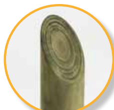
Dragons Tooth Top