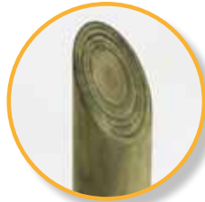
Dragons Tooth Top