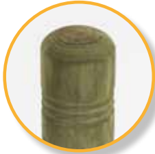
Low Dome Triple Rout